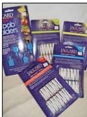
KABOB HOLDERS & SAFE COOK TIMERS