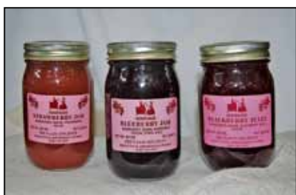
PINK LABEL JAMS & JELLIES If you've never tried them, there's no time like the present.