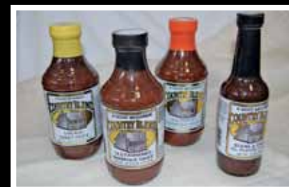
AGN COUNTRY BLEND SAUCES Use them as a marinade, a sauce, a dip ... yummy!