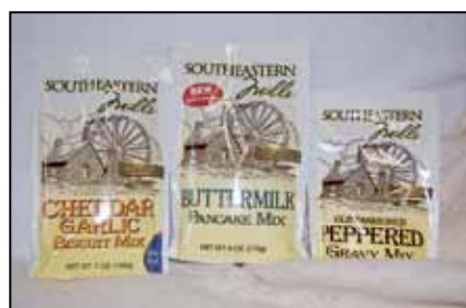
SOUTHEASTERN MILLS MIXES You've tried them, you love them, we have them!