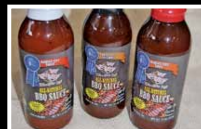
THREE LITTLE PIGS BBQ SAUCES 4.8 TO 19.5 OZ Will have you licking fingers, spoons, etc ... simply delicious!

524 S. MAIN STREET, MIDDLEBURY, IN 46540 AND OUR PHONE (574) 825-1677 HOURS M-F 8 TO 5 SAT 10-2 CLOSED ON SUNDAY