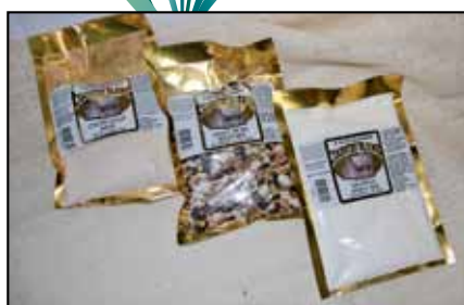
AGN COUNTRY BLEND SOUP & GRAVY MIXES Tastes just like Grandma's!

OUR REGULAR PRICES ON EVERY ITEM ON THIS PAGE FOR THE ENTIRE MONTH OF MAY!