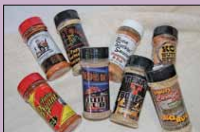
CHAMPIONSHIP RUBS From the East Coast to the West ... top winning rubs that you need to experience for yourself.