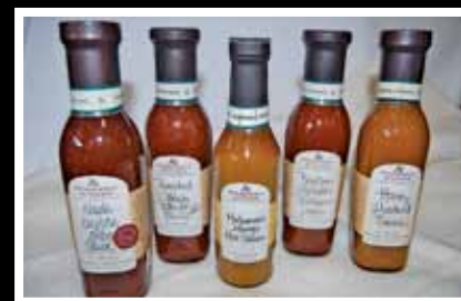
STONEWALL KITCHENS SAUCES Gourmet Sauces that transport your tastebuds to exotic places.