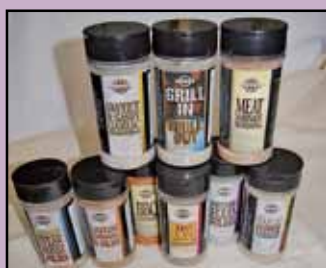
EXCALIBUR SEASONINGS & RUBS Specially blended spices enhance your meat and create a mean crave!