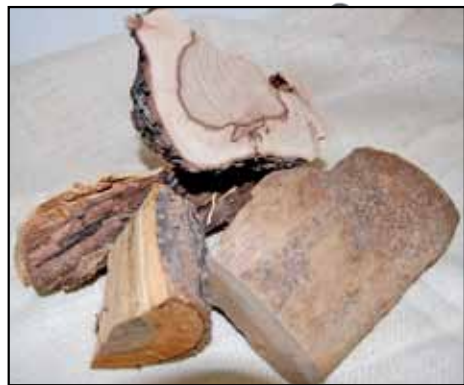
FLAVORED WOODS Smoking woods for the gourmet griller - we carry several flavors year-round!