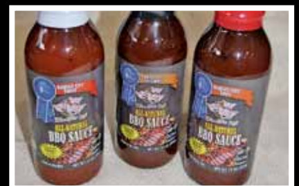
THREE LITTLE PIGS BBQ SAUCES 4.8 TO 19.5 OZ Will have you licking fingers, spoons, etc ... simply delicious!

524 S. MAIN STREET, MIDDLEBURY, IN 46540 AND OUR PHONE (574) 825-1677 HOURS M-F 8 TO 5 SAT 10-2 CLOSED ON SUNDAY