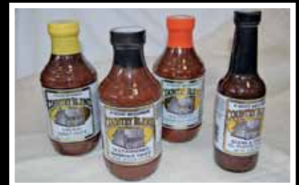
AGN COUNTRY BLEND SAUCES Use them as a marinade, a sauce, a dip ... yummy!