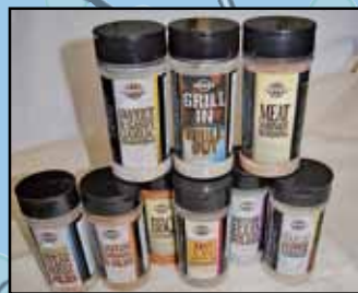
EXCALIBUR SEASONINGS & RUBS Specially blended spices enhance your meat and create a mean crave!