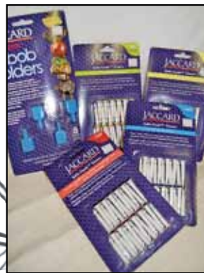
KABOB HOLDERS & SAFE COOK TIMERS