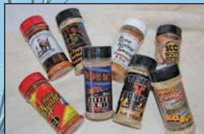
CHAMPIONSHIP RUBS From the East Coast to the West ... top winning rubs that you need to experience for yourself.