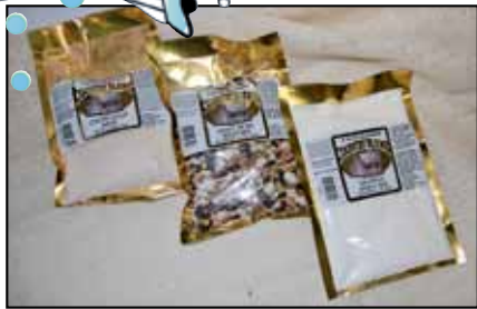
AGN COUNTRY BLEND SOUP & GRAVY MIXES Tastes just like Grandma's!

OUR REGULAR PRICES ON EVERY ITEM ON THIS PAGE FOR THE ENTIRE MONTH OF APRIL!