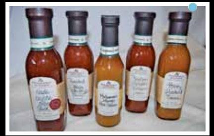
STONEWALL KITCHENS SAUCES Gourmet Sauces that transport your tastebuds to exotic places.