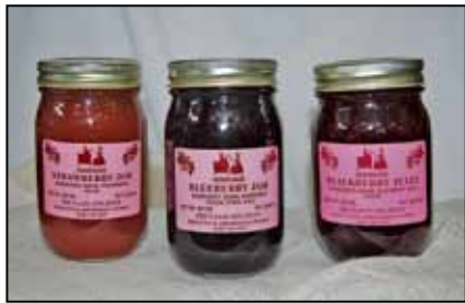
PINK LABEL JAMS & JELLIES If you've never tried them, there's no time like the present.