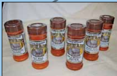
AGN COUNTRY BLENDS RUBS & SEASONINGS Our favorites! These little gems will infuse your meat with unbelievable flavor