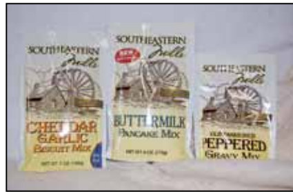
SOUTHEASTERN MILLS MIXES You've tried them, you love them, we have them!